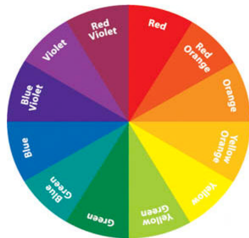
Figure 1. While combining flower colors is a personal choice, there are design principles to keep in mind. Use complementary colors on the opposite side of the color wheel or analogous colors adjacent on the color wheel. Examples of complementary colors are orange and blue or yellow and violet. Analogous color examples are orange and yellow, or blue and violet.