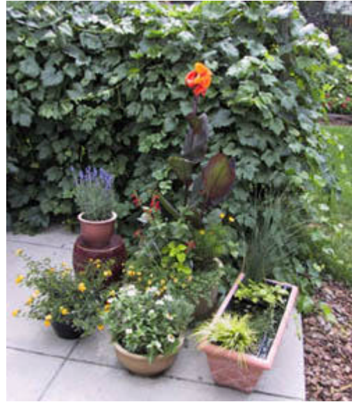
A grouping of containers of different heights includes a rectangular container water garden on the right.

Container water gardens may either be treated as annuals or brought indoors for the winter if a sunny location is available. Plants will require the same six hours