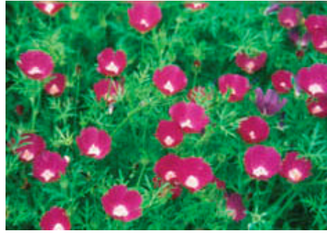
Figure 1: Callirhoe involucrata (Purple poppy mallow).

The perennials listed in Table 1 were specifically chosen because they require low or moderate amounts of water. Not all perennials listed are available at all nurseries and garden centers, so it may be necessary to contact a number of commercial outlets to find a specific plant. If a perennial is not sold in the trade, asking for it may improve its future availability. Native perennials should not be collected from the wild because this reduces biodiversity, causes a disturbed area that may be