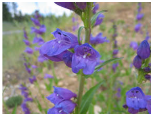
Figure 3: Penstemon strictus (Rocky Mountain penstemon).