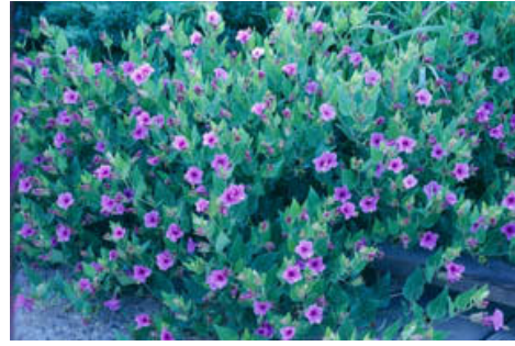
Figure 7: Mirabilis multiflora (Desert four o'clock).