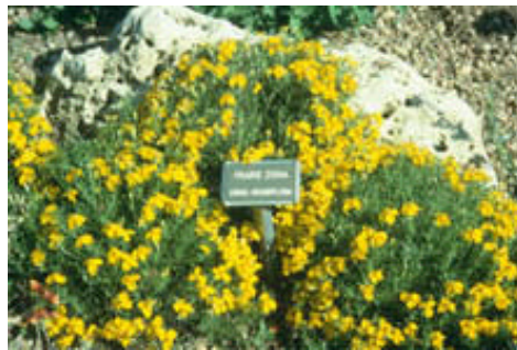
Figure 8: Zinnia grandiflora (Prairie zinnia).