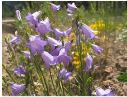
Figure 5: Campanula rotundifolia (Harebells).