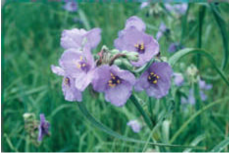
Figure 4: Tradescantia occidentalis (Spiderwort).

Most of the perennials listed in Table 1 are available as container-grown plants. Native perennials often do not have as great a visual impact in the container or immediately after planting as do traditional horticultural species. Over time, however, they will reward the homeowner with their natural beauty.